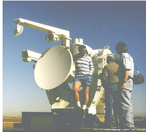
Figure 1. The NOAA/K radar's offset Cassegrain antenna. The rotatable phase retarding plate is located directly above the dish.

NOAA/K was one the first cloud radars to add scanning, Doppler, and polarimetric capabilities to further extend the realm of cloud features and processes that can be observed. Basic characteristics of the radar are listed in Table 1. Either of two antennas is used on a versatile scanning pedestal. The radar is transported to locations in North America on its 15-m flatbed trailer or it can be disassembled and transported overseas in two standard 6.1-m